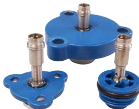
Valvecaps for use with cycle counter